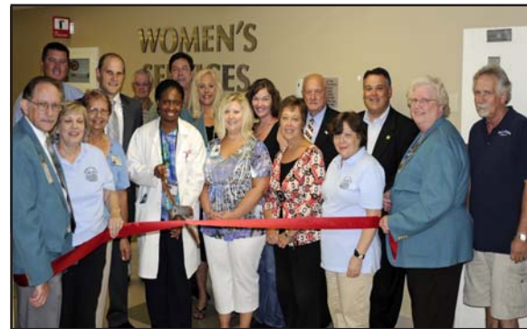
Ribbon Cutting for the newly renovated Women's Center

We are recruiting for Orthopedics, Neurology, ENT, Cardiology, Internal Medicine, and Family Practice.