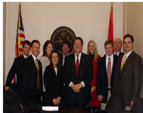
Adult Leadership Class of 2010

The Chamber partnered with Dyer County YMCA and Y-USA for the Pioneering Healthy Communities initiative. This program is designed to advocate healthier lifestyles through environmental change.