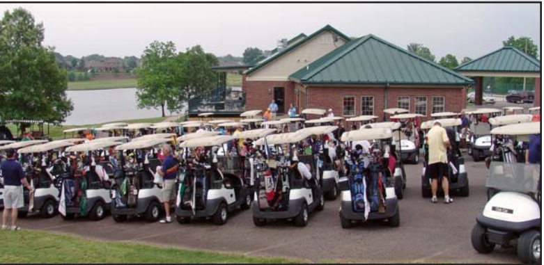
2010 Annual Chamber Golf Tournament

Work continues on obtaining and implenting various grants from USDA and other sources to complete renovations to the Farmers Market building and to construct a floating boat dock from which canoes and kayaks can be launched. The Downtown Development Association was recently awarded grant funds for these projects.