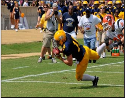
The Big River Bowl - August 28

The Young Farmers and Ranchers Program is still in place and has been a very positive partnership.