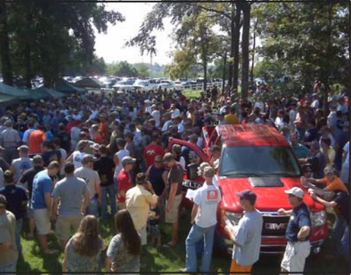
Great attendance for the Dyersburg Duckfest

We conducted the Annual Wage and Benefit Survey with guidance from HR Managers. Completed in March of 2010 with good participation.